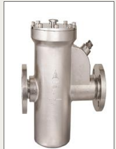
FOR LOW VISCOSITY LIQUIDS